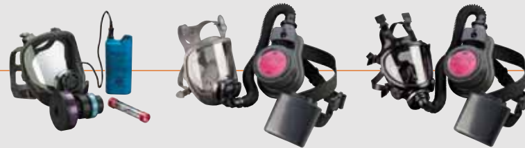
Face-mounted PAPR † (available for 6000 FF only)