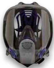
Ultimate FX FF-400