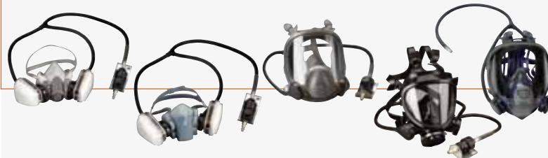
Dual Airline Supplied Air Respirator